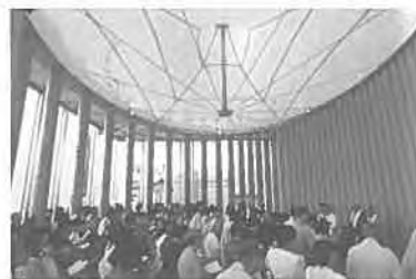
1995年に神戸に 再建された教会 の一部