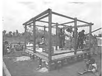
紙の筒を使用した 仮設住宅を建設 する様子

In 1995, there was a big earthquake in Japan. Mr. Ban soon went to Kobe. He saw a lot of people at a church. The church was destroyed in a fire after the earthquake, but they got together at the place. Mr. Ban had an idea to build the church again out of paper tubes. This idea was not accepted at first. He didn't give up, and he visited Kobe many times. He made more than 50 temporary paper buildings there. Making paper buildings was easy, and a lot of young people helped Mr. Ban. The paper buildings he designed were strong and beautiful. Finally, his idea was accepted, and he began to make the church out of paper. After only five weeks, the paper church was made. He thought it was a temporary building, but the paper church was not just a temporary one for people in Kobe. It became an important place for them, and it was used for more than ten years. In 2005, the paper church was dismantled and sent to people in another place who also lost their church. It was built again and is still used even now. People in Kobe are glad because the building they loved is used again in another place.